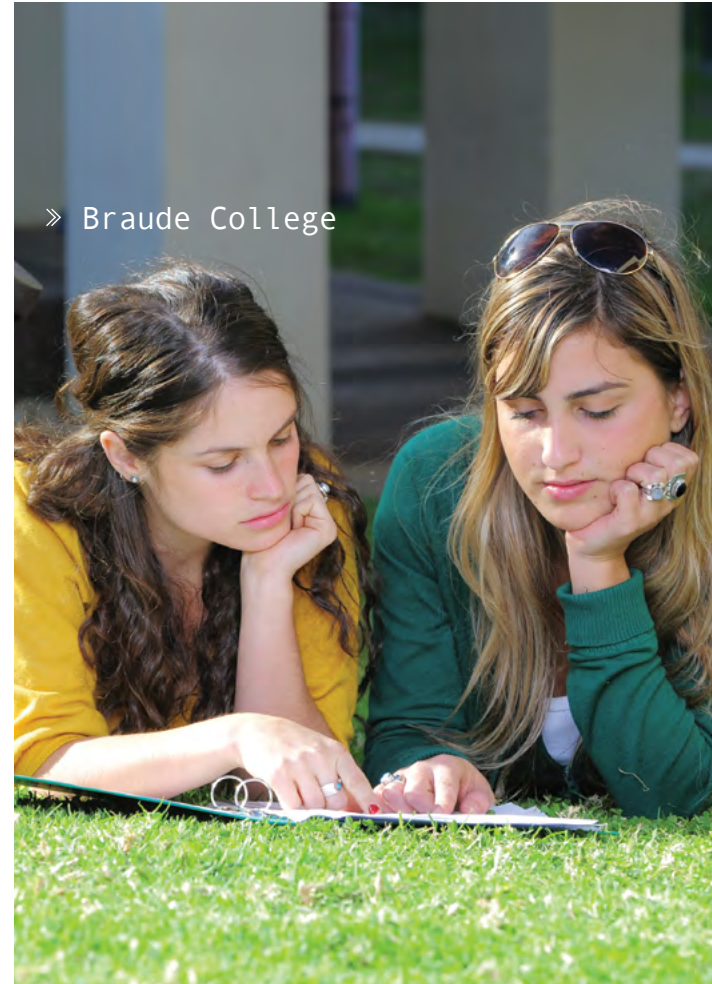
» Braude College

Braude College, based in the city of Karmiel, is a leading engineering institution in northern Israel. Established in 1987, the beautifully landscaped college has about 2,900 undergraduate and graduate students.